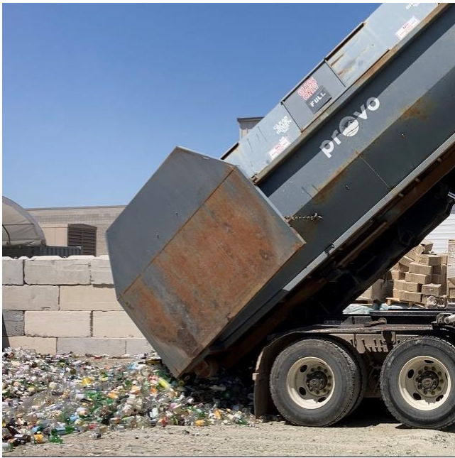
Cities pay to recycle their glass waste