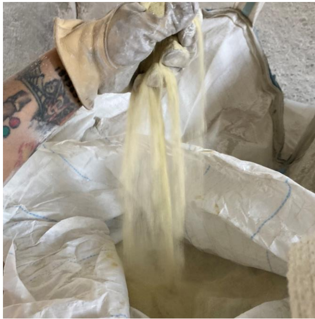
Glass crushed to fine sand