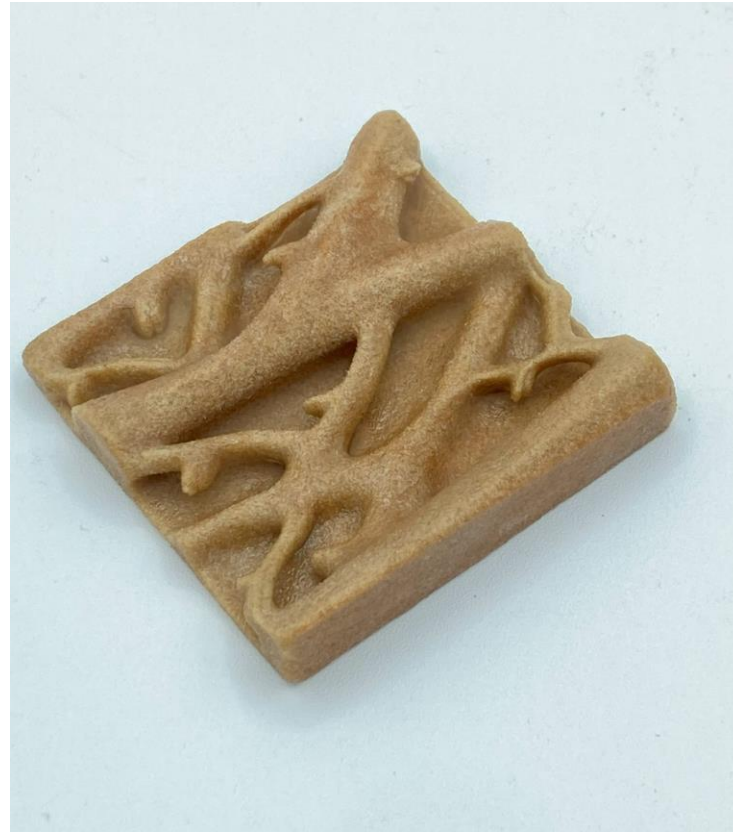
Custom Luxury Tile