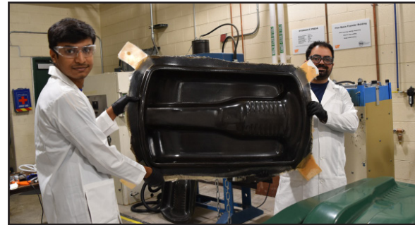
Students show the finished carbon fiber composite sled.

The advantage of fiber reinforced sleds over traditional plastic sleds is the higher mechanical performance and durability, in addition to weight reduction that leads to aerodynamic performance improvement.