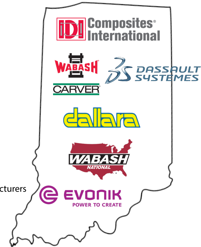
IACMI Members in Indiana

Source: Indiana Economic Development Corporation